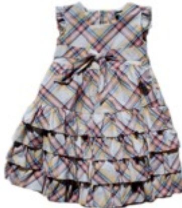
RUFFLE DRESS- PLAID Cotton plaid fabric Sizes; 6m-6yrs