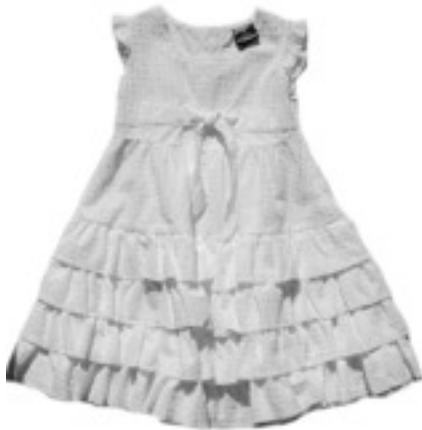
RUFFLE DRESS-WHITE Cotton dress w/ front tie & ruffles raised dotted swiss fabric Size; 6m-6yrs