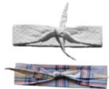
HEADBAND-PLAID OR WHITE Adjustable tie headband Sizes; one size